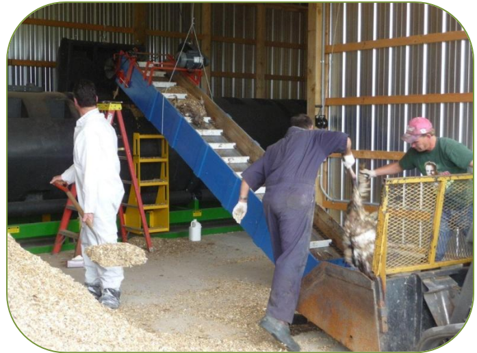
(ABOVE: Using a shredder and conveyer to load the Ecodrum)