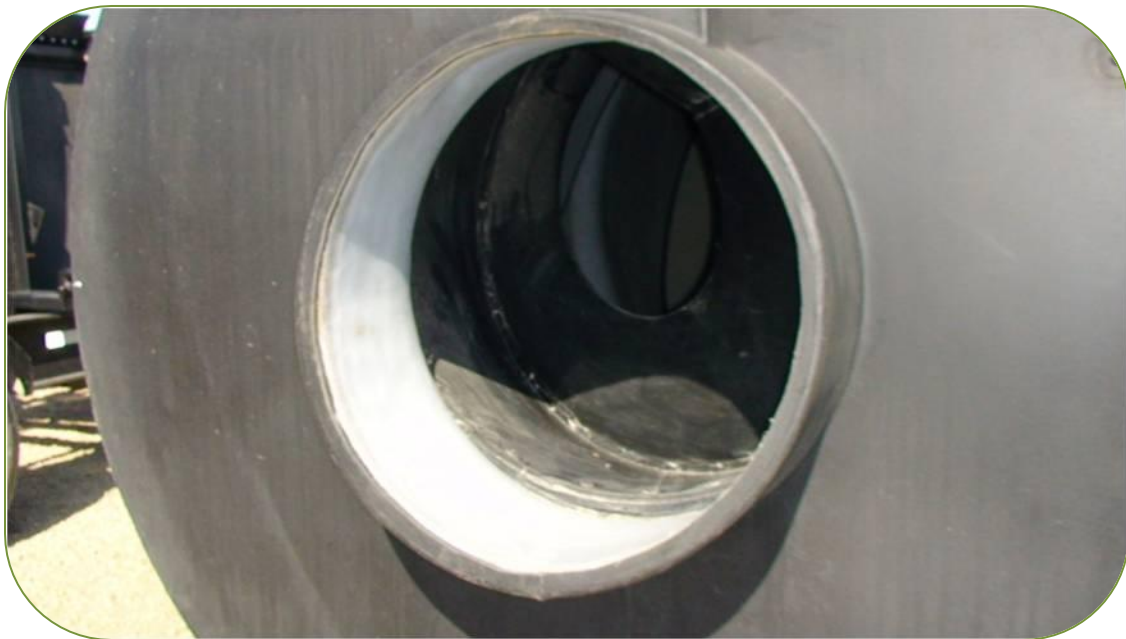
(ABOVE) Exiting end of the Ecodrum

Your material will exit as the drum is spinning. By operating with the Ecodrum control box and 24hour timer your compost will automatically dispense as it works its way down the drum.